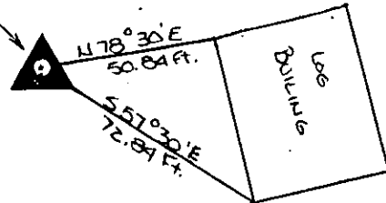
SKETCH OF CORNER.

FOUND A STONE 0.3' UNDER SURFACE OF ROAD. NO BT'S AVAILABLE