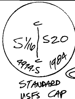
STANDARD USFS CAP

Office of Clerk and Recorder, County of Lincoln . This "corner record" was filed for record on December 11, 84 was noted on the cross-index plat and is assigned page No. 2833 , in book No. _____