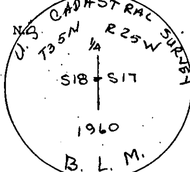
DIAGRAM OF CORNER: