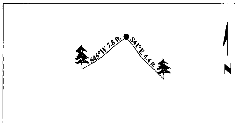
SKETCH OF CORNER