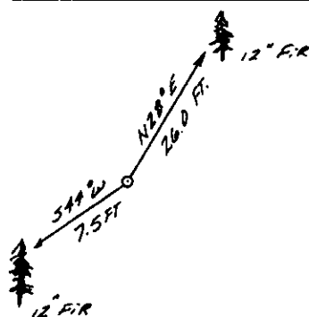
SKETCH OF CORNER