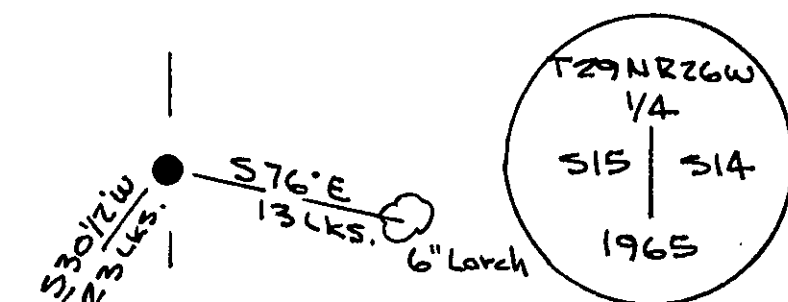
SKETCH OF CORNER

Office of Clerk and Recorder, County of Lincoln . This "corner record" was filed for record on the August 25 th day of 19 83 was noted on the cross-index plat and is assigned page No. 2305 , in book No. _____