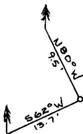
SKETCH OF CORNER

Found 2 bearing trees, on Lake Shore, scribing visible. Unknown origin.