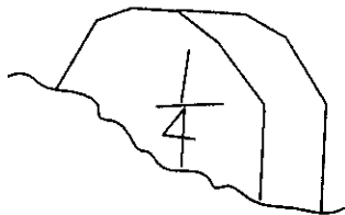
SKETCH OF CORNER