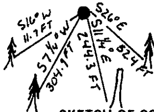
SKETCH OF CORNER

Painted red bands around the bearing trees and attached Bearing Tree and Land Survey Monument signs. Set a 6 ft. galvanized steel guard post with Land Survey Marker and Property Boundary decals, 4 ft. South. Magnetic Declination: 20° 30' East