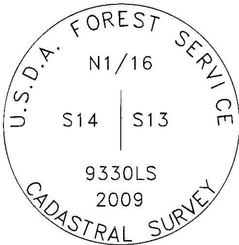
SKETCH OF CORNER