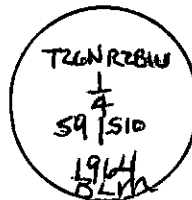
Sketch of brass cap

As corner and accessories were in good condition, left corner as described in record. Repainted bearing trees.