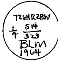
Sketch of brass cap

As corner and accessories were in good condition, left corner as described in record. Repainted bearing trees.