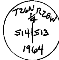
Sketch of brass cap

As corner was in good shape, along with its accessories, left corner as indicated in record. Repainted bearing trees.