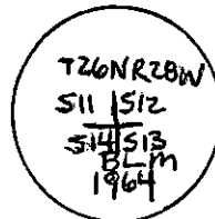
Sketch of brass cap

As corner and accessories were in good condition, left corner as described in record. Repainted bearing trees.