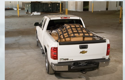
Properly secured loads utilize "bed nets" like this, tarps, and adjustable or ratcheting tie downs.